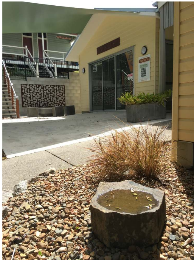
Photo taken in direction of front entry